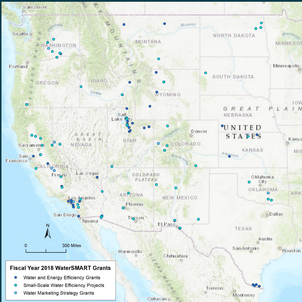
Map of FY 2018 WaterSMART Grants